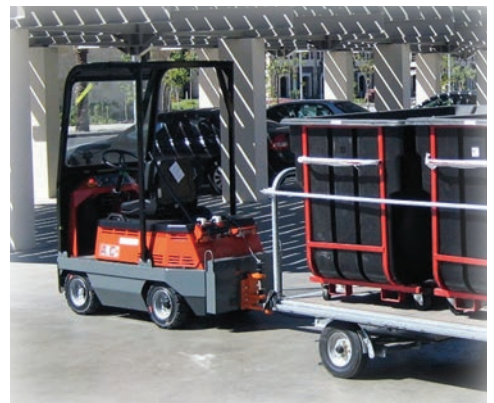
Note: Vehicles in photos show optional equipment.

The Huskey II AC combines high-powered towing in a compact maneuverable tow tractor, while providing optimal safety, comfort and ease of use.